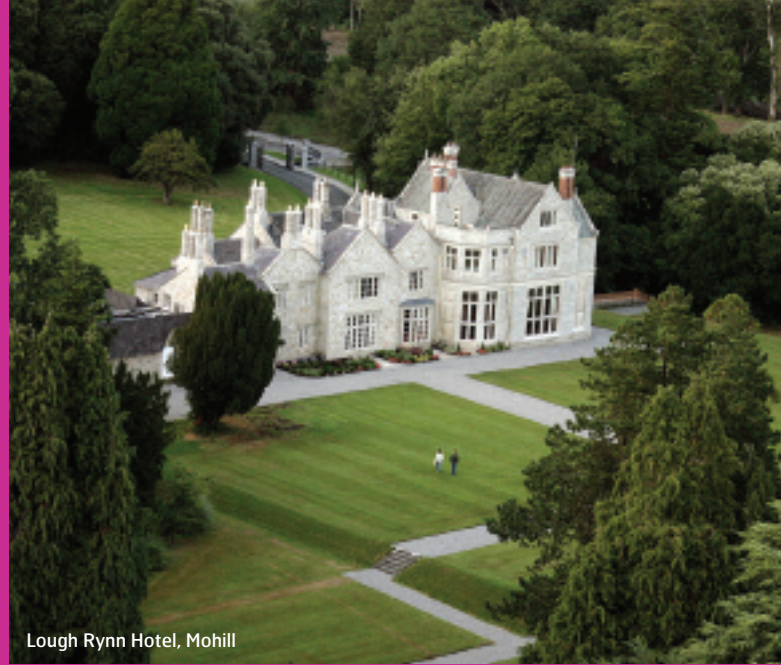
Lough Rynn Hotel, Mohill