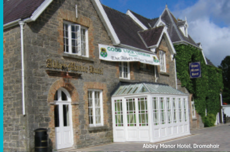
Abbey Manor Hotel, Dromahair