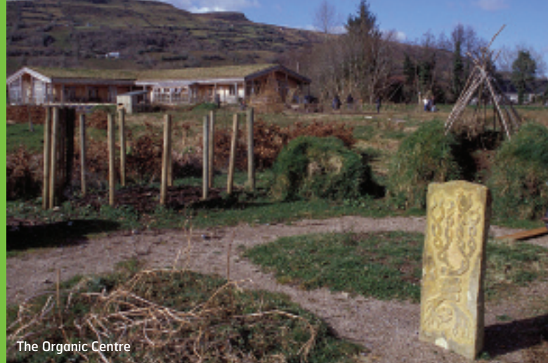
The Organic Centre