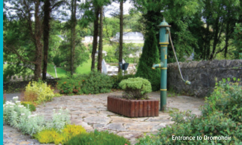
Entrance to Dromahair